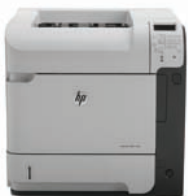
HP LaserJet Enterprise 600 M603dn