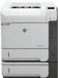
HP LaserJet Enterprise 600 M603xh