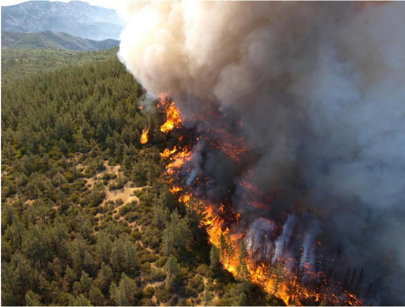
Californian Forest fires wreak havoc amongst local communities and create a major pollution hazard

so that the technology is available to all scientists, governments and NGOs working to combat wildfires globally.