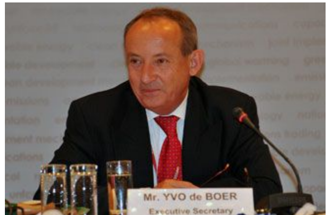
Yvo de Boer

According to Yvo de Boer, the four essentials calling for an international agreement in Copenhagen are: