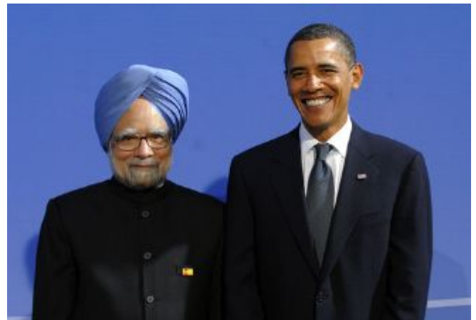
Indian Prime Minister Manmohan Singh with U.S. President Barack Obama.

An administration official told reporters that President Obama would propose the targets before the climate meeting, thus removing the biggest obstacle to a political agreement in Copenhagen.