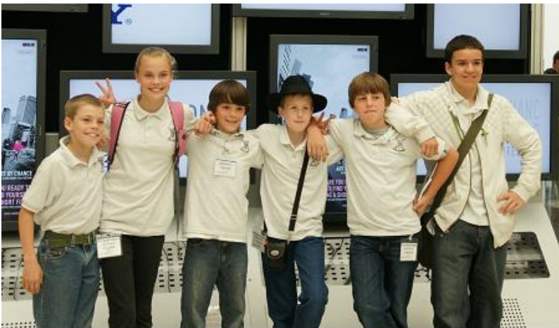
The Forest Guard team will showcase their concept at COP15

company offered to partner with the team to bring their idea to life.